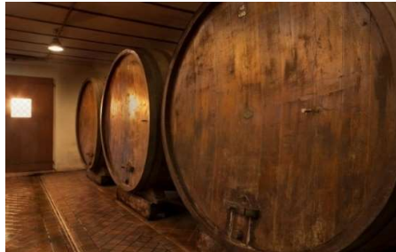
The cellar at Francesco Rinaldi, a bastion of tradition