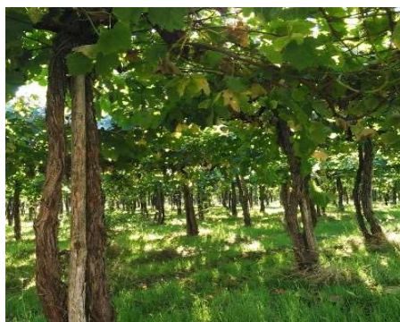
Trebbiano Abruzzese vines trained in the old double-Pergola style

*Note: There is some confusion between the two names Trebbiano Abruzzese, the wine grape and Trebbiano d'Abruzzo, the DOC wine. In fact Trebbiano d'Abruzzo wines can be made from Trebbiano Toscano, Trebbiano Abruzzese or Bombino Bianco. To add to the confusion, Trebbiano Abruzzese is also often mistaken to be Passerina in the vineyards; Only about 20-30% of Trebbiano-type grapes in Abruzzo are the genuine Trebbiano Abruzzese.