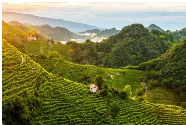
The hills of Conegliano make for a spectacular sight