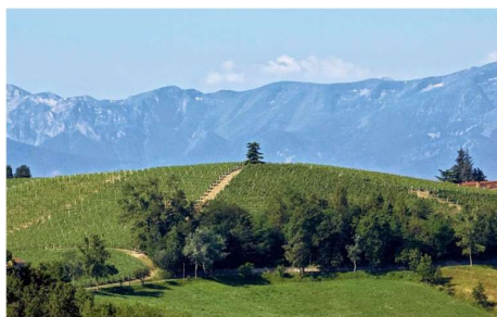
The Briccolero vineyard in the San Luigi district of Dogliani