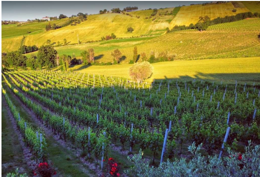
Fattoria San Lorenzo in the hills of Montecarotto, Marche