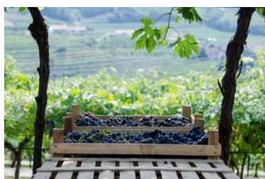
Drying grapes in racks or straw mats - the appassimento process