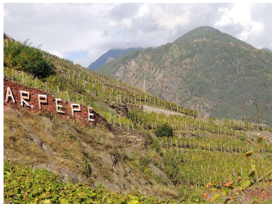
Italy is full of small wine denominations that speak of a specific history and culture

We personally seek out and follow the wineries and vineyards we work with to understand the people, the style, and the commitment behind these wines. Rather than pursuing the latest trends and ‘must-have’ producers, we prefer to work with wineries who have a strong local reputation and who have worked consistently for many vintages, making quality yet authentic wines that reflect the place and the conditions of the growing season. We believe in building long term relationships with them, following the wines and winemaking as they develop and fine tune through the years.