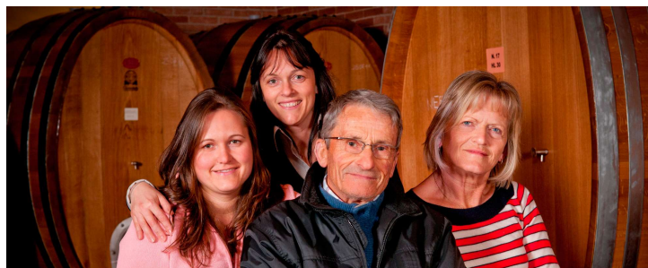
Cigliuti, another little family winery making sublime Barbaresco

A relatively recent discovery, Cigliuti is a small winery in Neive with just seven hectares of vineyards - holdings that include Serraboella, one of the most famous and important crus in all of Barbaresco. The wines fly under the radar due to the small scale of their operation but make no mistake, those in the know will recognise the quality of these wines, some of the best and most quintessential in the Barbaresco denomination. They make two Barbarescos, from the aforementioned Serraboella as well as Vie Erte, from the Bricco di Neive vineyard. The style here is powerful and rich yet complex and well-balanced.