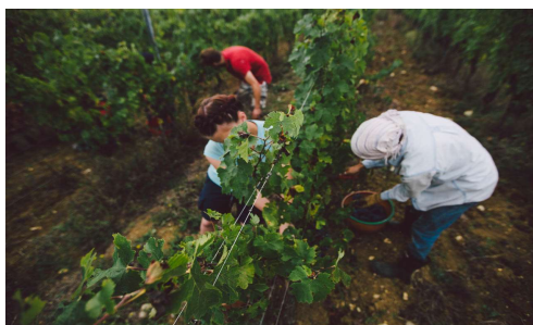
Harvest time at Montesecondo