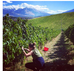
It's also full of diverse terroirs and unique local wine grapes

We sincerely hope that our selection, or any bottle of good Italian wine for that matter, can transport you to the magnificent landscape and warm, passionate people of this magical country - full of history, character and the artisan spirit.