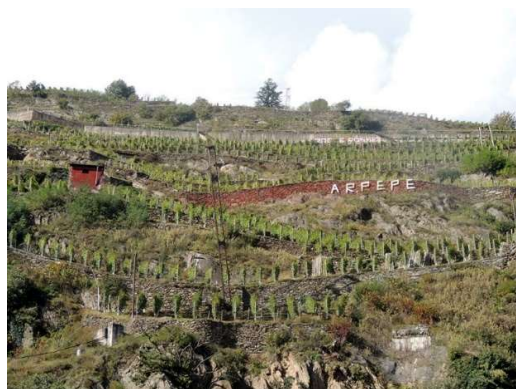
The remarkable vine-growing terraces in Valtellina