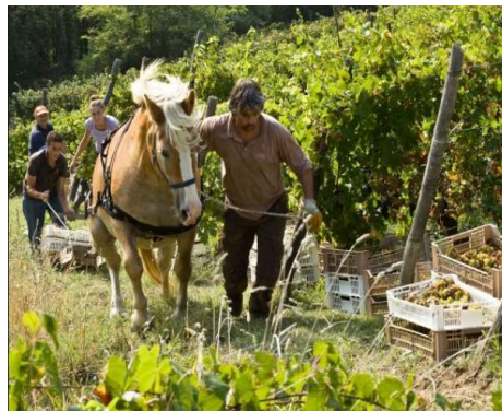
Manual and sustainable farming at this small winery